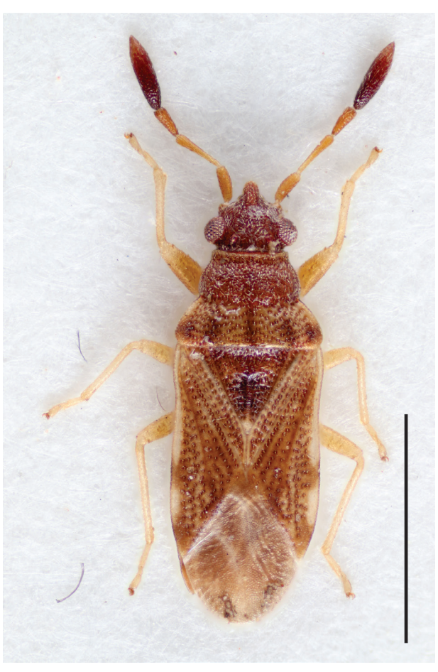
Figure 1. Malleusocoris minimus gen. nov., sp. nov. Habitus of male holotype. Scale bar: 1 mm.